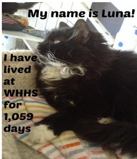
Luna found her forever home in April 2016