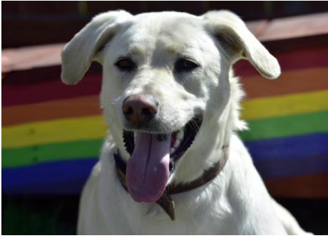
Cocoa is available for adoption June 5 th .